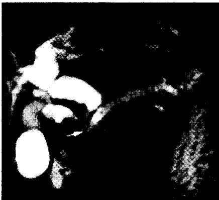
Figure 3 MRCP of a 63-year-old male patient in whom ERCP failed because of duodenal stenosis. The calcified pancreatic head obstructs the Wirsung duct and the common bile duct (arrow) with an upstream dilation, causing the "double duct sign". The intrahepatic biliary tree and the cystic duct are also dilated. The patient underwent choledochojejunostomy, gastrojejunostomy and Wirsungogastrostomy.

In a patient with chronic pancreatitis, whose disease was not followed up regularly, ERCP was indicated because of obstructive jaundice, but it failed in consequence of duodenal stenosis. MRCP showed obstruction of the Wirsung duct and the common bile duct by the calcified