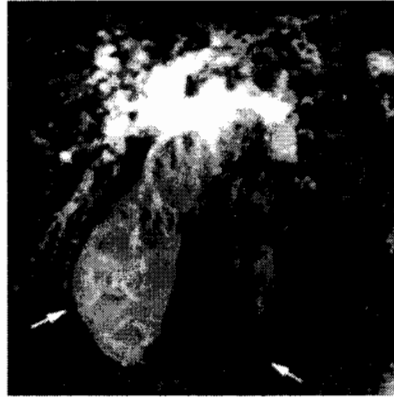
Figure 1 MRCP of a 78-year-old female patient. The common bile duct is dilated with a stricture at the level of the papilla of Vateri (open arrow), with multiple stones in the gallbladder (solid

arrow). The Wirsung duct is not visible.