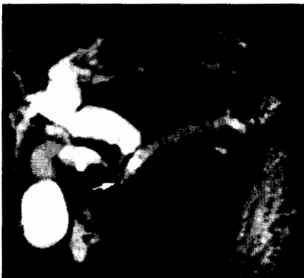
Figure 3 MRCP of a 63-year-old male patient in whom ERCP failed because of duodenal stenosis. The calcified pancreatic head obstructs the Wirsung duct and the common bile duct (arrow) with an upstream dilation, causing the "double duct sign". The intrahepatic biliary tree and the cystic duct are also dilated. The patient underwent choledochojejunostomy, gastrojejunostomy and Wirsungogastrostomy.

In a patient with chronic pancreatitis, whose disease was not followed up regularly, ERCP was indicated because of obstructive jaundice, but it failed in consequence of duodenal stenosis. MRCP showed obstruction of the Wirsung duct and the common bile duct by the calcified